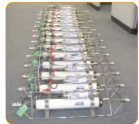
Multiple Argonaut-MD systems with integrated CT sensors and load cages

T: +44 (0)2392 488240 E: osil@osil.co.uk W: www.osil.co.uk