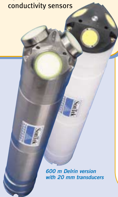
600 m Delrin version with 20 mm transducers