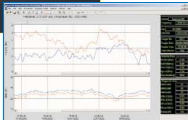
ViewArgonaut Windows software for data display and analysis.