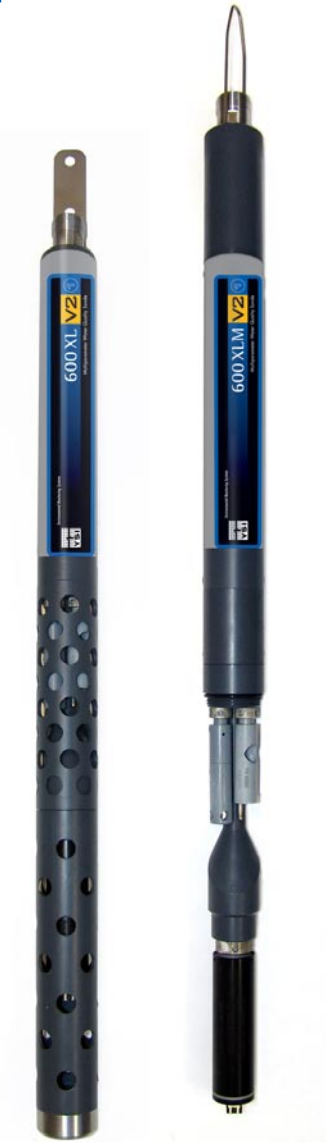
Left: 600XL V2-1 with two-piece probe guard; right: 600XLM V2-1 sonde with optical DO sensor (bottom) and batteries (top)

Either sonde can easily connect to the YSI 650 handheld logger/display, YSI 6200 DAS (Data Acquisition System), web-enabled YSI EcoNet® or your own data collection platform, via SDI-12, for remote and real-time monitoring applications.